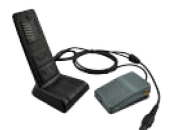
Desktop Mic & Pedal PTT